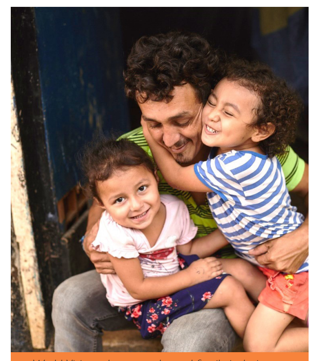
World Vision takes a gender and family-inclusive approach, supporting fathers to promote child wellbeing.

Embracing Communities - The health and nutrition of children is greatly impacted by social norms and structures, and the ability of communities to assume ownership of their own health and nutrition outcomes. In World Vision's experience, communities want to improve their children's health and nutrition, but benefit from mobilization support. Forming and strengthening community health committees provides a forum in which they can learn about the local