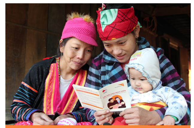
Two-hundred and fifty million children in LMICs – over 40% – risk missing critical development milestones due to inadequate nurturing caregiving.

Whereas the MDG era successfully emphasized child survival, leading to global assimilation of a "I,000 day" (conception through two years) priority, the SDG era is expanding its predecessor's "survival" concept, and promoting a more holistic health and well-being paradigm. The child survival focus remains, but is accompanied by