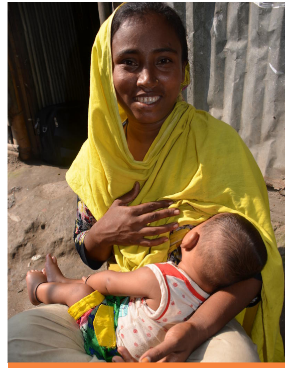
Exclusive breastfeeding, one of the single highest impact health interventions available, has seen no global increase and has less than 50% coverage.

Globally, the world is off-track to achieve nutrition targets such as those established in the UN Decade of Action for Nutrition (2016 - 2025). In fact, a third of the world's population suffers one or more forms of malnutrition. Decreases have been seen