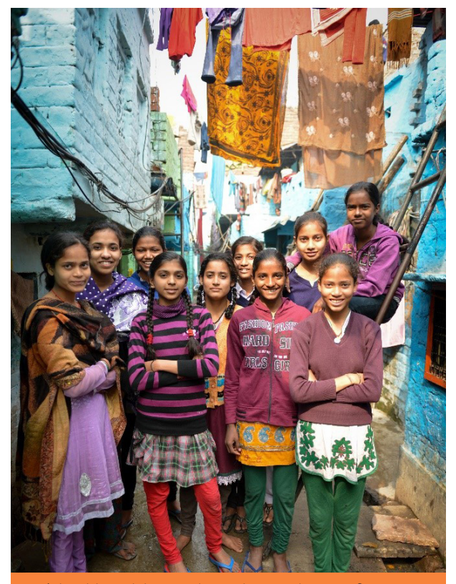
A healthy adolescent has a better chance of becoming a healthy parent in later life, who in turn has a better chance of having a healthy baby.

This impact group recommendation is well aligned with the World Vision Partnership strategy, as well as the SDGs for health and nutrition, and contemporary global health strategy. The new approach provides greater opportunity to address the significant health and nutrition needs