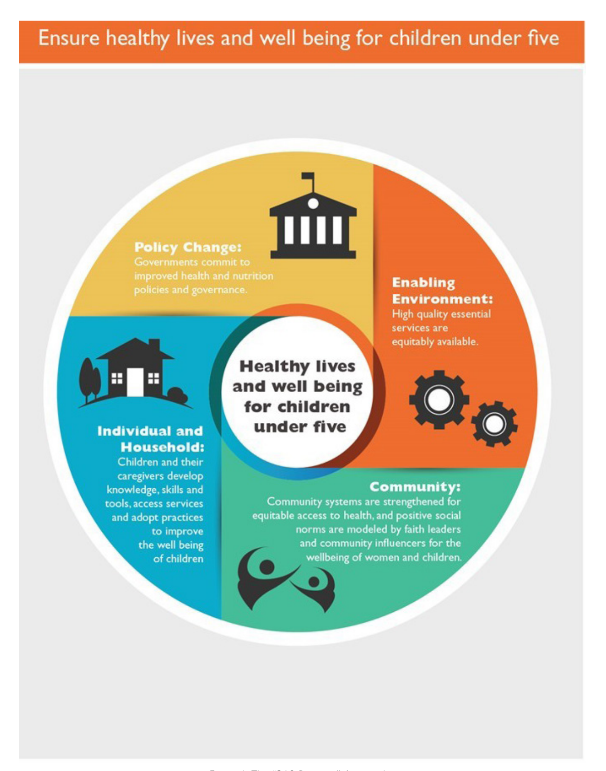
Figure 1. The "360 Degrees" Approach

Strengthening Health Systems - No community is complete without equitable access to quality essential primary health care services. Every mother should have access to antenatal care, mental health services, and skilled birth attendance; every newborn to post-natal care; every infant to immunization and infant and young child feeding counselling for their caregivers; every adolescent to nutrition and life skills counselling; and every woman planning motherhood to sexual and reproductive services.