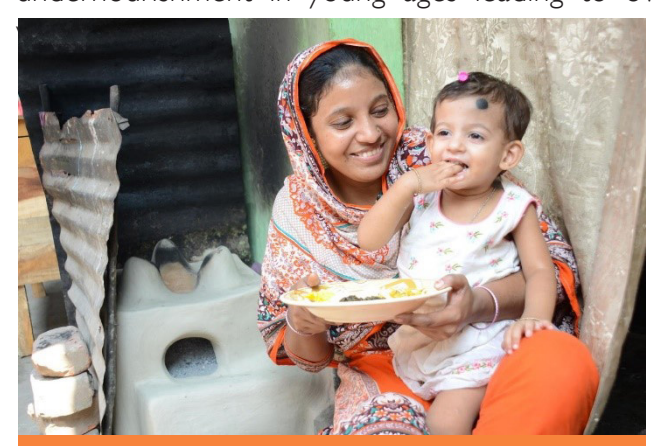
It is estimated that elimination of maternal depression may reduce stunting by up to 27%.

in stunting (though 22% of children remain stunted), while wasting continues unabated (only 20% of young children with severe malnutrition receive assistance), and obesity and micronutrient deficiencies such as anaemia are increasing. In a grand irony, we now see a triple burden of malnutrition in many countries: undernourishment in young ages leading to overweight and micronutrient deficiencies later in life. And